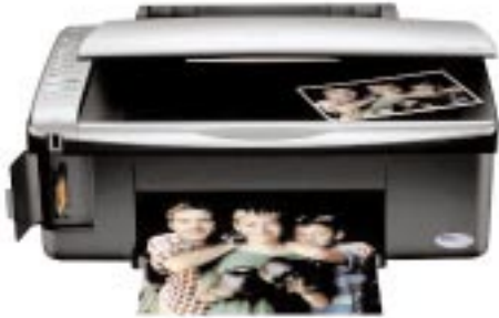
EPSON STYLUS CX 4200 ALL-IN-ONE, Printer, Copier, Scanner

At the member raffle at the November 12, 2005 meeting, I was the lucky winner of the Epson Stylus CX 4200 all-in-one color printer/copier/scanner.